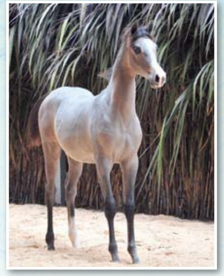
Premiera al Tahel, x Pershana el Jamaal, 7 months old grey filly