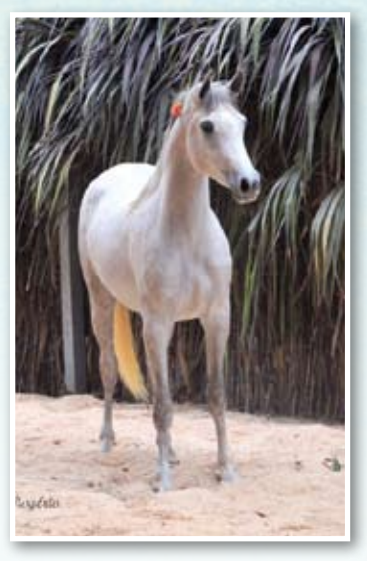
Starlet el Ludjin, x Star el Johann, 2 years old, grey filly