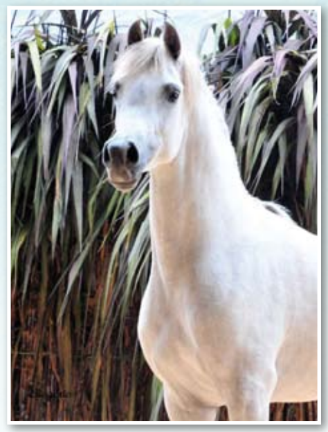
Persyan el Ludjin x Perfectshahn by Bey Shah, 4 years old grey stallion of Haras Meia Lua

In the end, came the 3 sons of Ludjin: Jahad el Ludjin, Persyan el Ludjin and Eman el Lu-