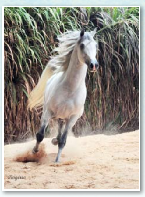
Jahad el Ludjin x Justine el Jamaal, 7 years old, grey stallion of Haras Meia Lua

djin, a young grey colt 6 months old. Everybody loved them, specially the little colt.